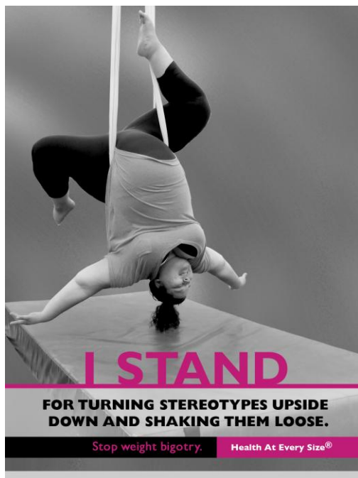
Figure 6 5

Some of the most critical work that fat activist communities on the internet are engaged with is offering alternative narratives about health. In a cultural moment where “health” is a major buzzword with plenty of policing power, advocates for the Health at Every Size movement are making visible new possibilities of what health can look like. This photograph is typical of the types of photographs of fat people living good lives that are interesting and rewarding.