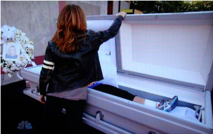
Figure 4 Retrieved from: http://200poundquest.com/biggest-loser-season-14/biggest-loser-recap-episode-9.html